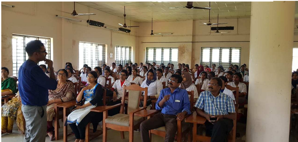
Interaction with the audience

A programme was organised by ASAAC on 27 th September 2018 for creating awareness among the students. The Excise team visited our institution and delivered short talks on Drug Abuse.